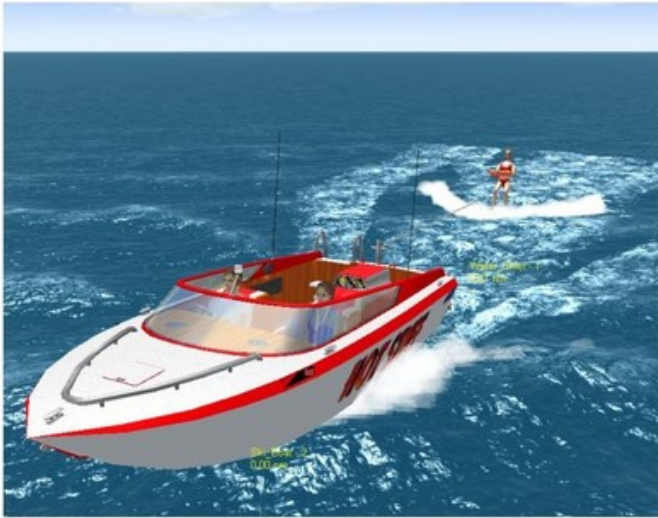
Skier and Ski Boat